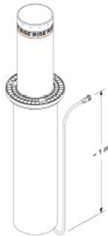
VIGILANT 500 - 200x500x8mm