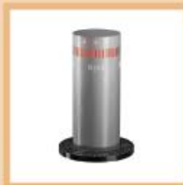
Stainless steel versions available