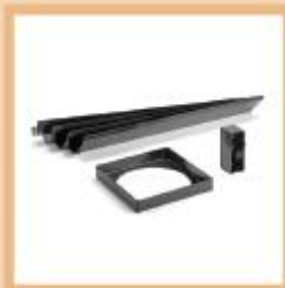
Easy assemble foundation case and cover