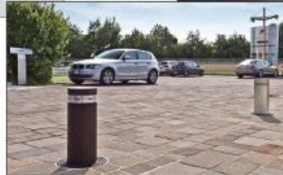
VIGILANT 500 VIGILANT 800