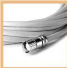
IP68 connector from motor to control panel

Built-in battery back up for single fail safe operation